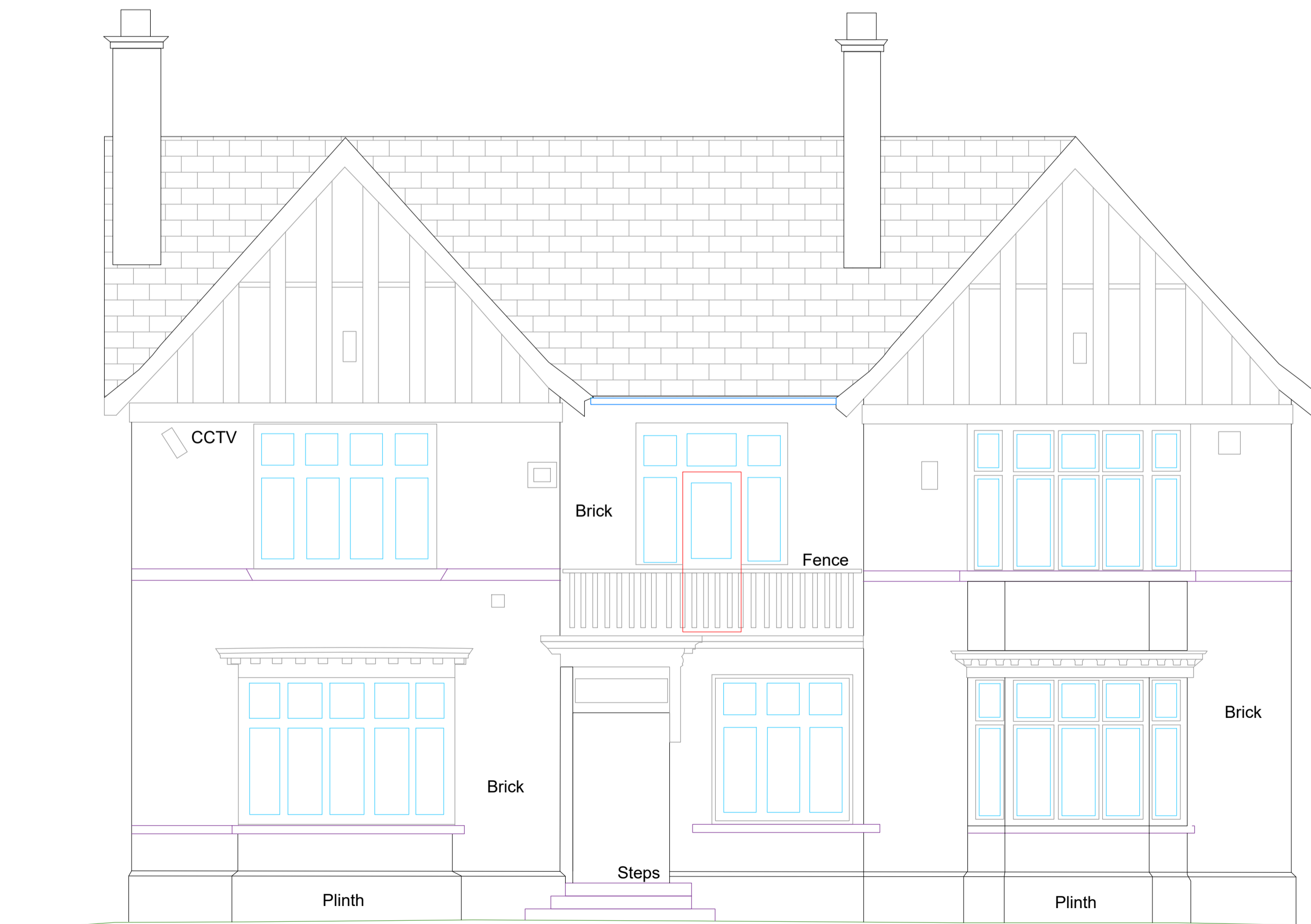
Front Elevation (Vivian Ave) - Datum: 64.00m