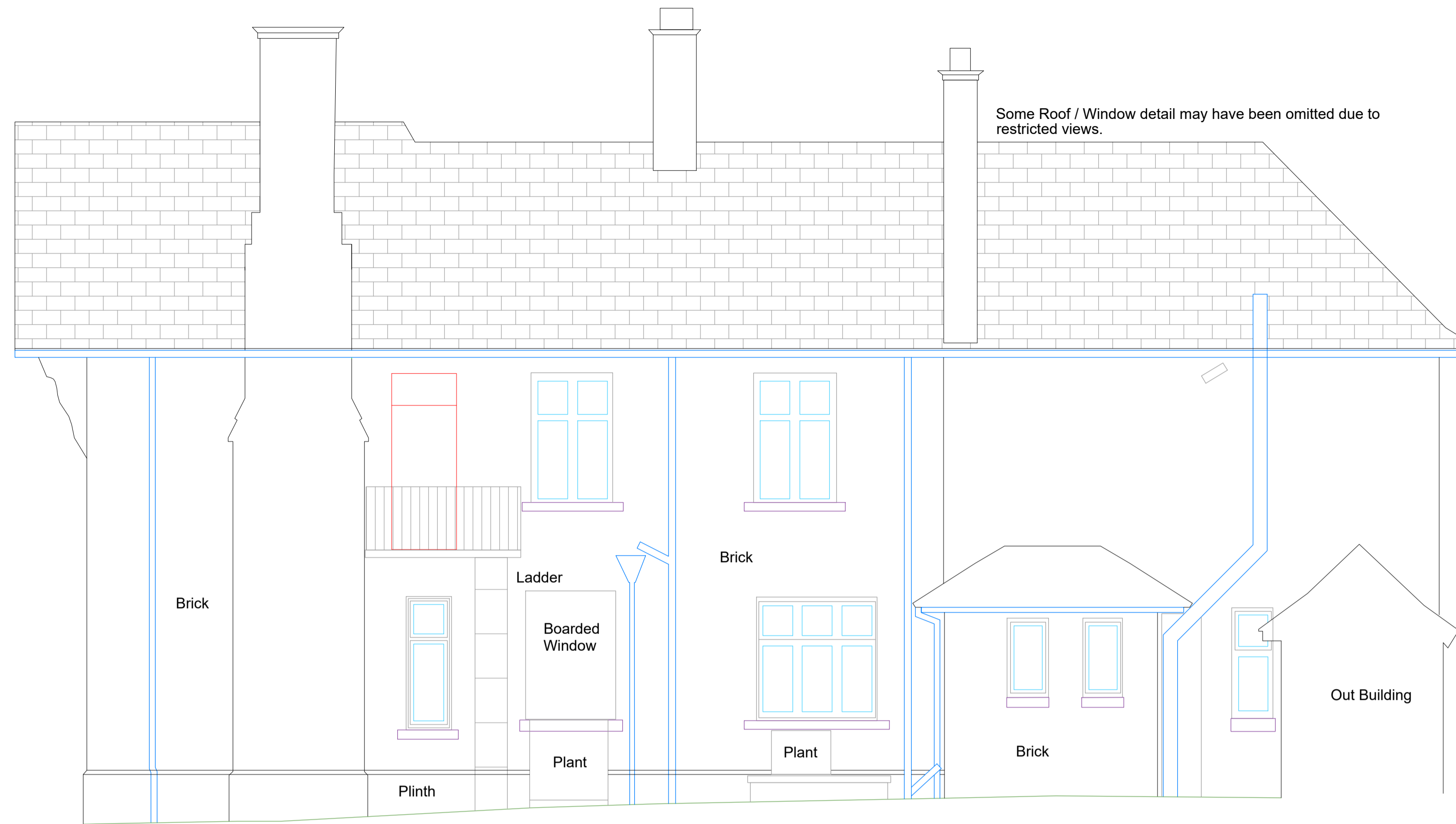
Side Elevation - Datum: 64.00m